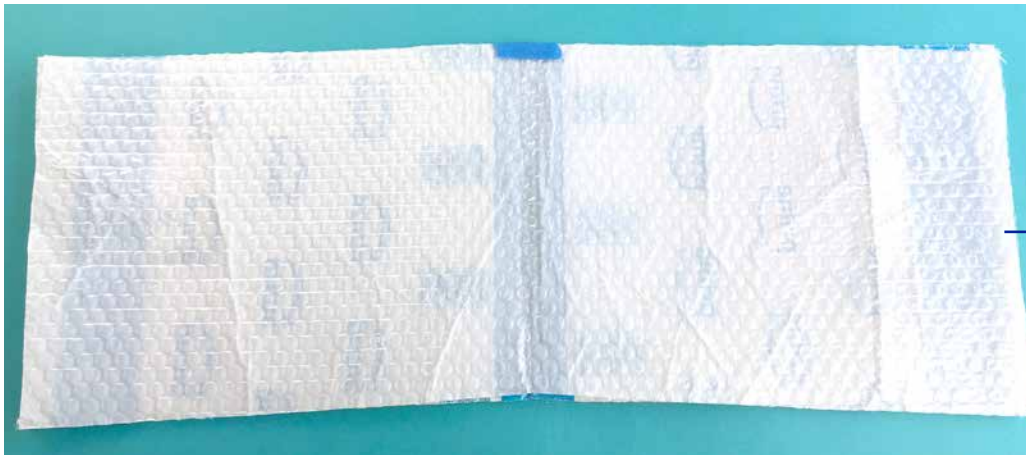
Stacked Deconstructed Mailers

Rotate the mailers as necessary to completely seal the long-edged sides together.