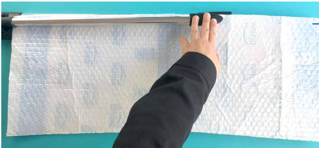
Heat Seal one Long Edge